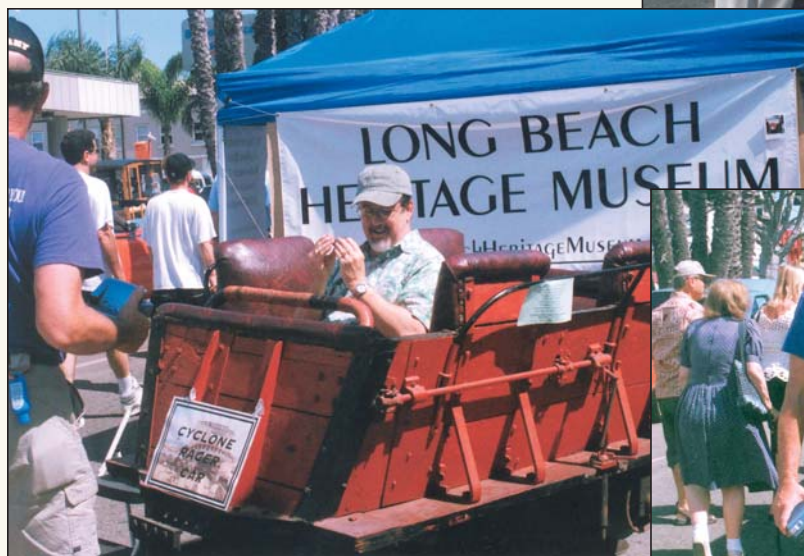
Visitor having his picture taken in the roller coaster car